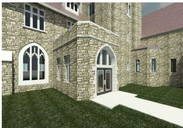
Architectural rendering of the new accessibility entrance at 470 Maple Street

Our desire to repair and modernize the buildings entrusted to us by the saints who came before us speaks to our desire to preserve our best opportunity to serve as we are called in the challenging days ahead. Our 90-year-old buildings fortunately serve us well, and historically we have only needed to invest in them when absolutely necessary. It is necessary now.