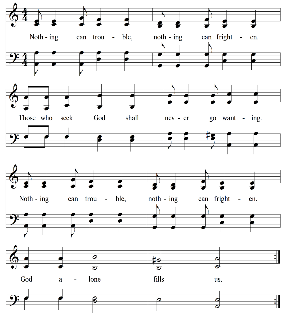
© 1986 Les Presses de Taizé, GIA Publications, Inc., agent. All Rights Reserved. Reprinted under OneLicense.net #A-707934