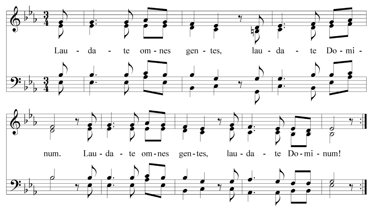
© 1979 Les Presses de Taizé, GIA Publications, Inc., agent. All Rights Reserved. Reprinted under OneLicense.net #A-707934