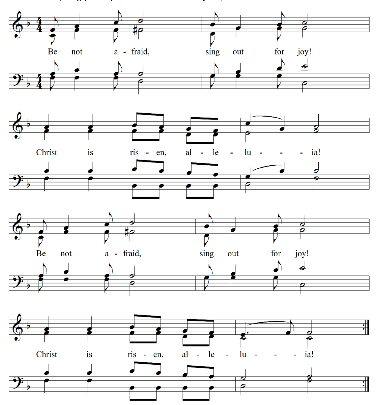
© 1998 Les Presses de Taizé, GIA Publications, Inc., agent. All Rights Reserved. Reprinted under OneLicense.net #A-707934

Be Not Afraid (sung first by a cantor and then by all)