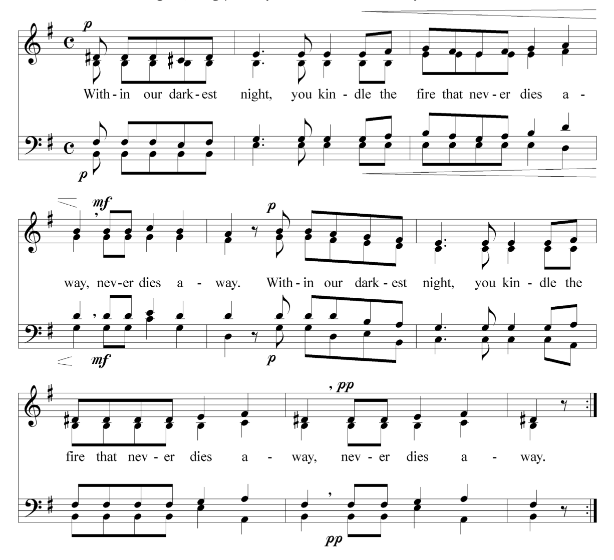
© 1991 Les Presses de Taizé, GIA Publications, Inc., agent. All Rights Reserved. Reprinted under OneLicense.net #A-707934